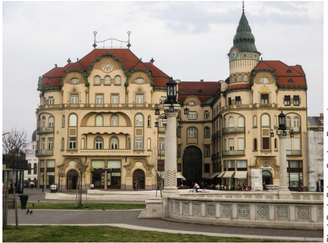
Black Eagle Palace, Oradea, Romania