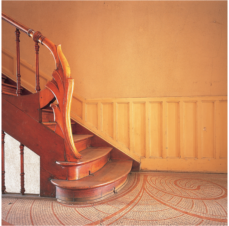
Maison Aurtrique, Victor Horta